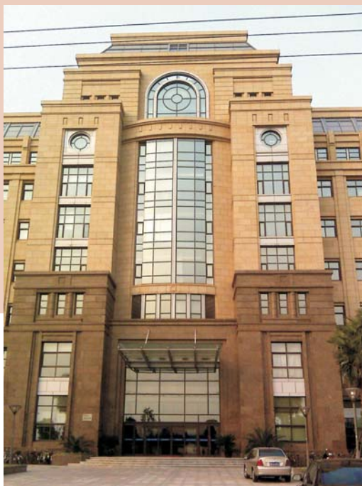
Figure 3. China's recent investment in physics is reflected in the architecture of physics buildings. Building D at the Institute of Physics in Beijing (left) houses offices and a conference hall. It was built in 2004. The new physics building at Fudan University in Shanghai houses labs and offices. It was built in 2008.