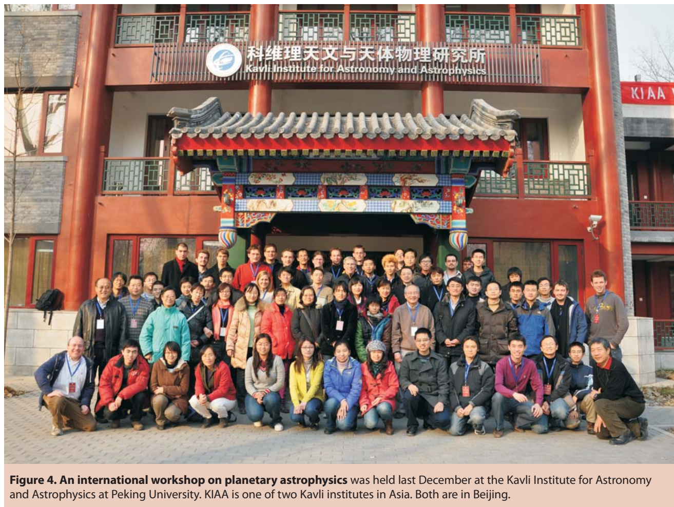
Figure 4. An international workshop on planetary astrophysics was held last December at the Kavli Institute for Astronomy and Astrophysics at Peking University. KIAA is one of two Kavli institutes in Asia. Both are in Beijing.

Telescope, a US–Canadian project to build a huge segmented-mirror observatory on Mauna Kea in Hawaii.